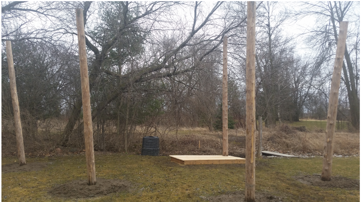
Figure 4. Posts and Stage Installed