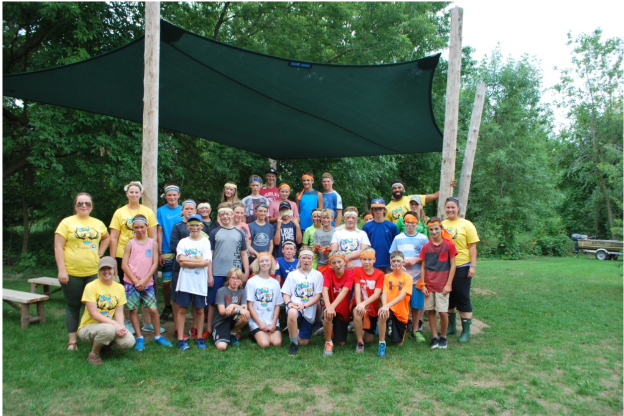
Figure 10. One of five OFAH Summer Day Camps using the classroom in 2016. 1,364 students used this space between September 2016 and June 2017.