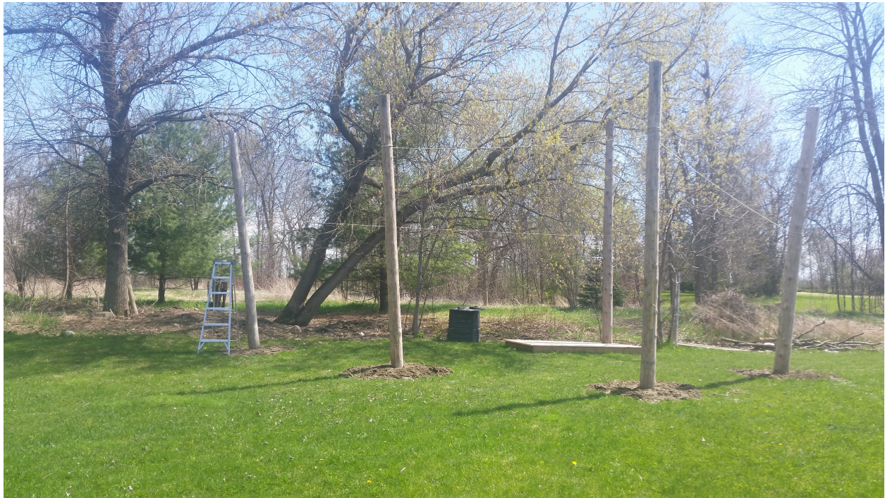
Figure 5. Measuring distances between posts for sun shade sail.