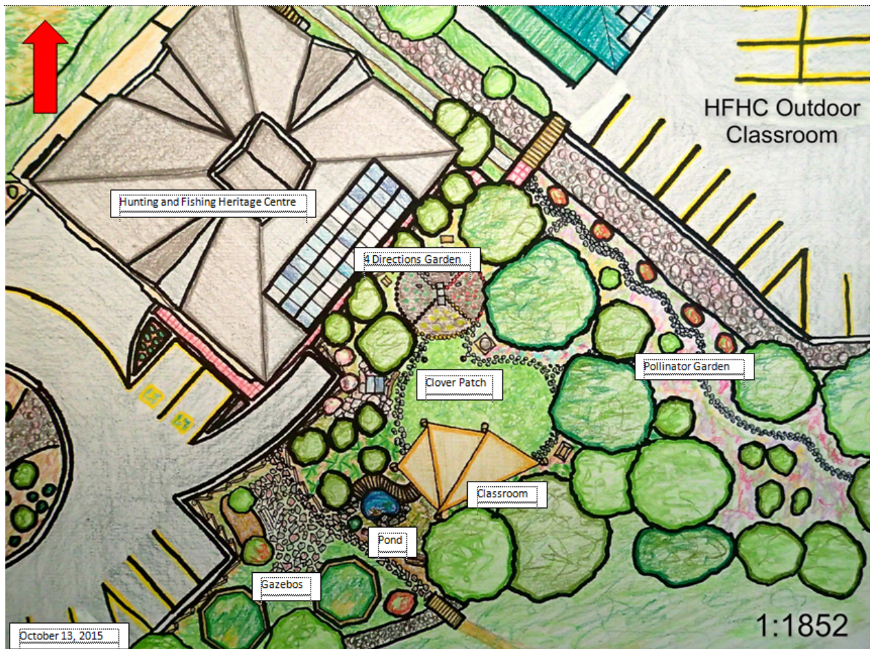
Figure 3. Detailed outdoor classroom plan