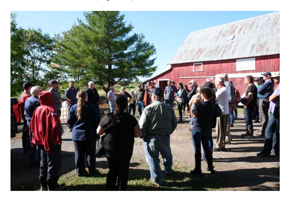
Figure 1: Community members visit Kirkview Farms, one of five stops at ALUS Ontario East Agri-Action Environmental Stewardship Tour.

The tour was a great success and received enthusiastic support from attendees and collaboration partners. Nearly 50 people attended the tour which was organized in collaboration with Raisin Region Conservation Authority (RRCA), South Nation Conservation (Eastern Ontario Water Resource Program), Boisé Est, the provincial Ministry of Agriculture, Food and Rural Affairs (OMAFRA) and the Ontario Woodlot Association (Figure 1).