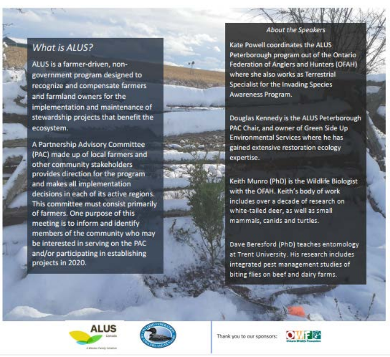
Figure 2: Invitation to ALUS Peterborough's Open House, featuring recognition of OWF as an event sponsor.