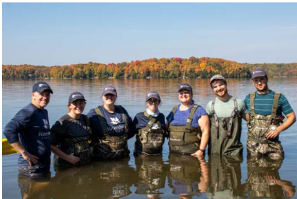
Watersheds Canada staff after the successful washing of the spawning bed.