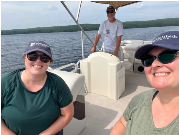
Watersheds Canada staff and a lake volunteer conduct the site visit.