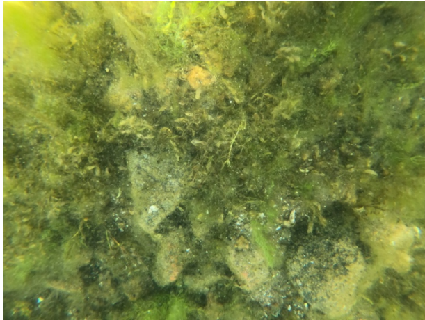
State of spawning bed before washing.