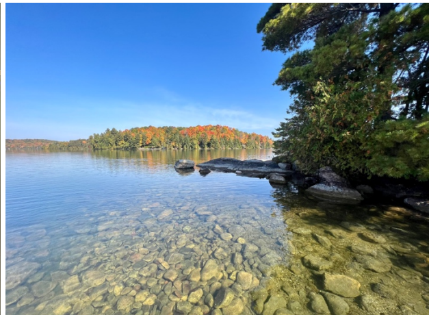
The cleaned spawning bed after washing.