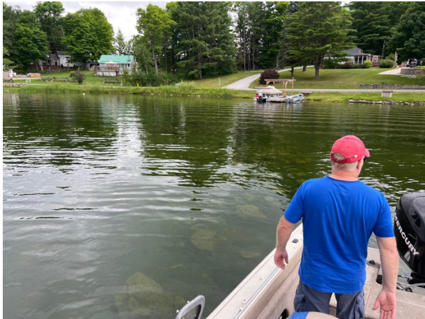
Above water views of the historic walleye spawning bed as seen during the summer 2023 site visit with a lake volunteer and Watersheds Canada staff.