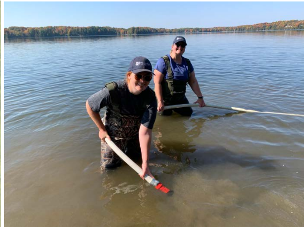
Watersheds Canada staff washing the bed.