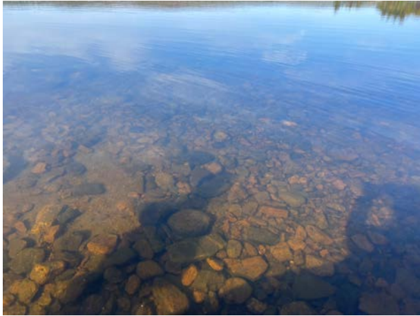
Lake trout spawning bed before restoration takes place.