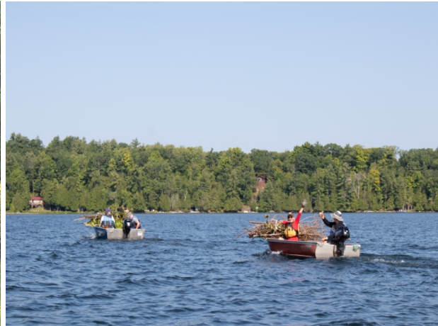
Community members and Watersheds Canada staff work together to build and deploy 23 brush bundles.